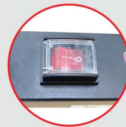
Lighting Switch w/Guard