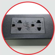
TIS Outlet w/Eye Shutter