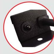
Electronic Circuit Breaker