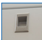
Slide Latch w/logo