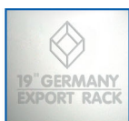
Front Door w/logo