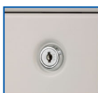
Security Cam Locks