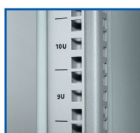
Mounting Pole w/screen UH